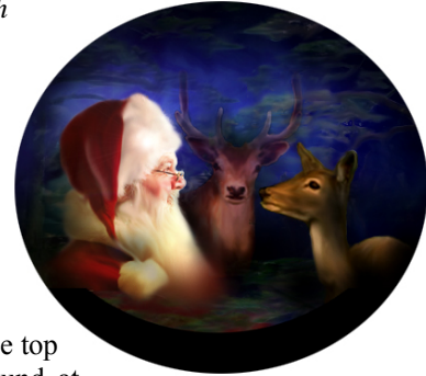
An original drawing from The Storybook Advent Calendar illustrating L. Frank Baum's First Journey with Reindeer .

Photos and hi-res product shots available at: http://www.storybookadvent.com/Marketing.htm